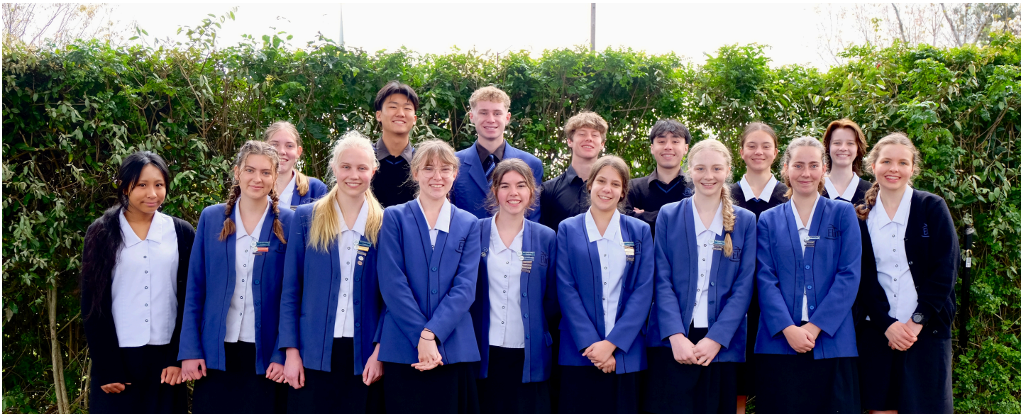
Kia ora tatou

I would like to take a moment to commend our exceptional Year 13 students as they conclude their time at school. Their remarkable contributions this year have set a standard of excellence and they have been inspiring role models for all students. Thank you for embodying our school values of manaakitanga (respect), māia (courage), pukuahuwhenua (diligence) and aroha (kindness). May God bless you as you finish your schooling at Elim Christian College.