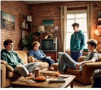
Year 7-13: Loungewear