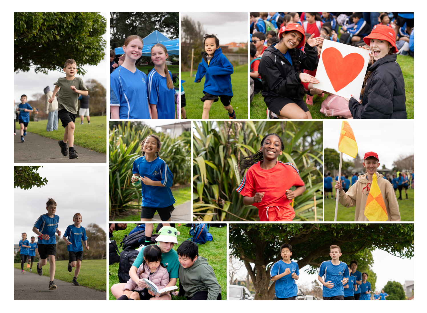
Find more photos from <u>here</u>.

It was an amazing day. The weather was ideal for running and we were so blessed to have Owairaka Park to run in, which is just down the road. Thank you to all the parents that came down to help or to support their child/children. It was an incredible day and it was amazing to see the Elim Christian College community gathered together. Amazing running, everyone! Well done!