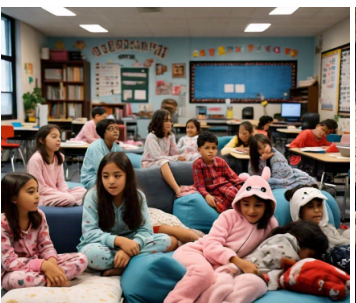
Year 1-6: Pyjamas

There will be an opportunity for Y0-6 fathers to visit their child/ren class/es between 8.30am and 9.00am for some special Father's Day activities.