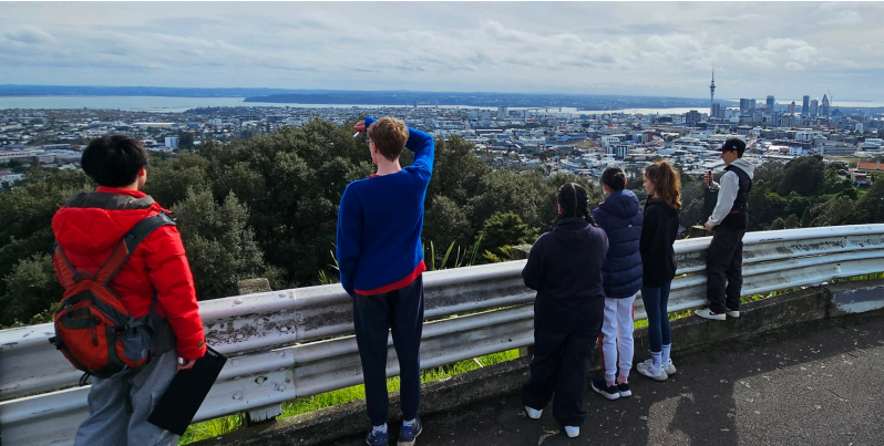
View from Maungawhau

On the 2nd August, 11 Geography visited several of Auckland's volcanic landforms. It was a beautiful clear day to see the views of the city and harbours. The students observed craters and tuff rings, scoria cones, lava flows and other important landforms created by volcanic processes. They also enjoyed the museum display.