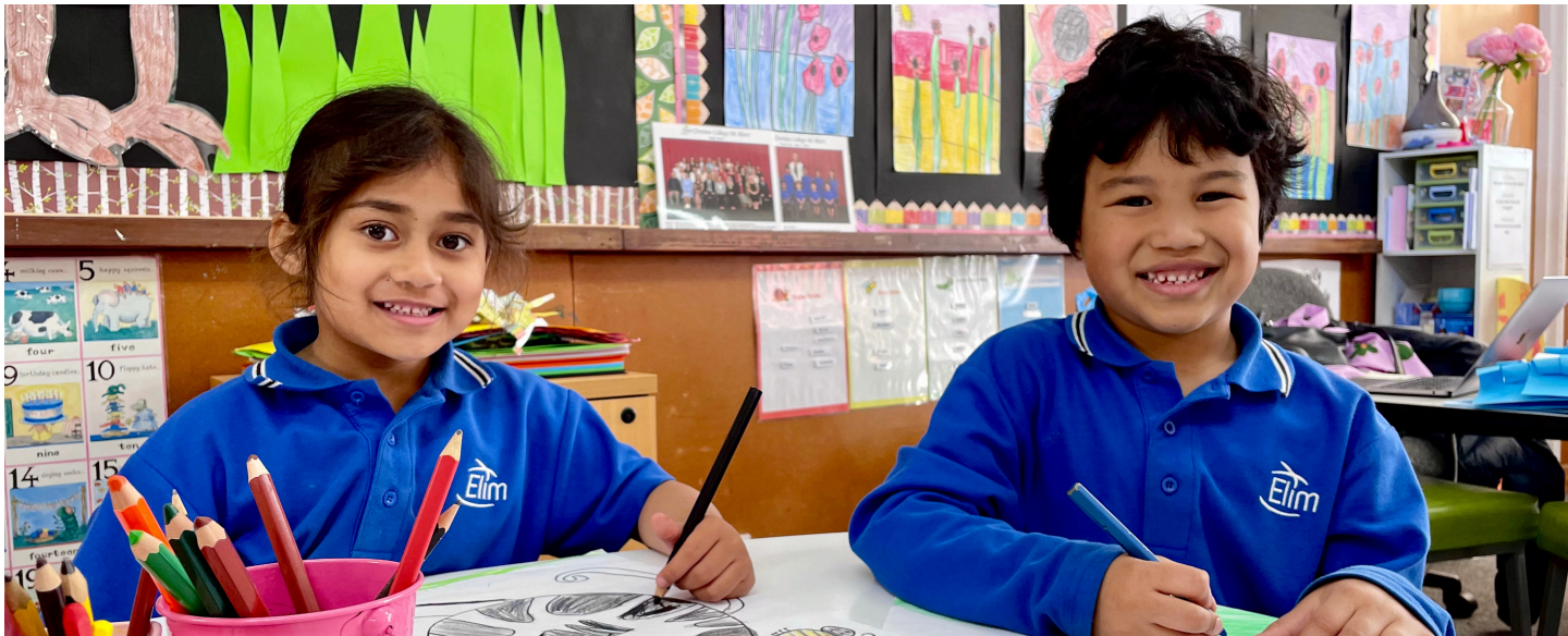
Kia ora tatou