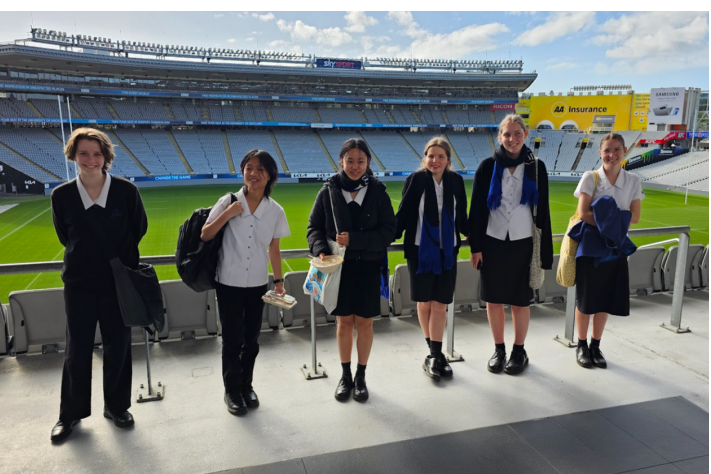
Year 12 and 13 Geography at Eden Park.