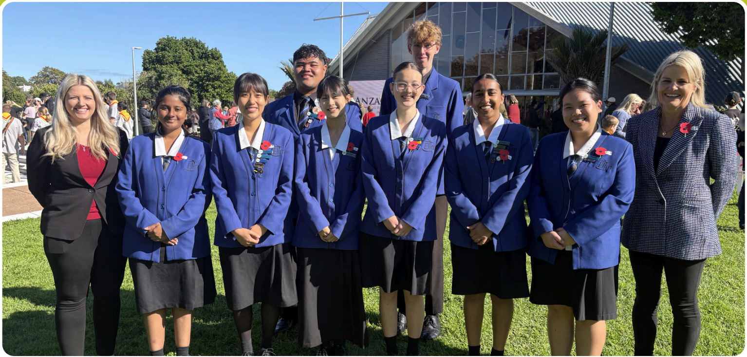
Tenā Kotou katoa