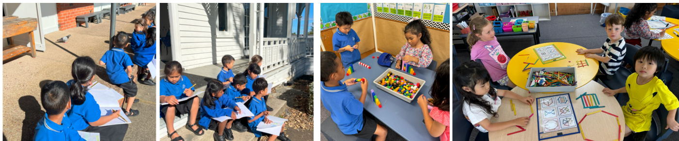
Room 25 observing birds after being inspired by the story "A bird's tale". Here they are watching how birds walk, what they eat and how they fly - then drawing them and writing about them.