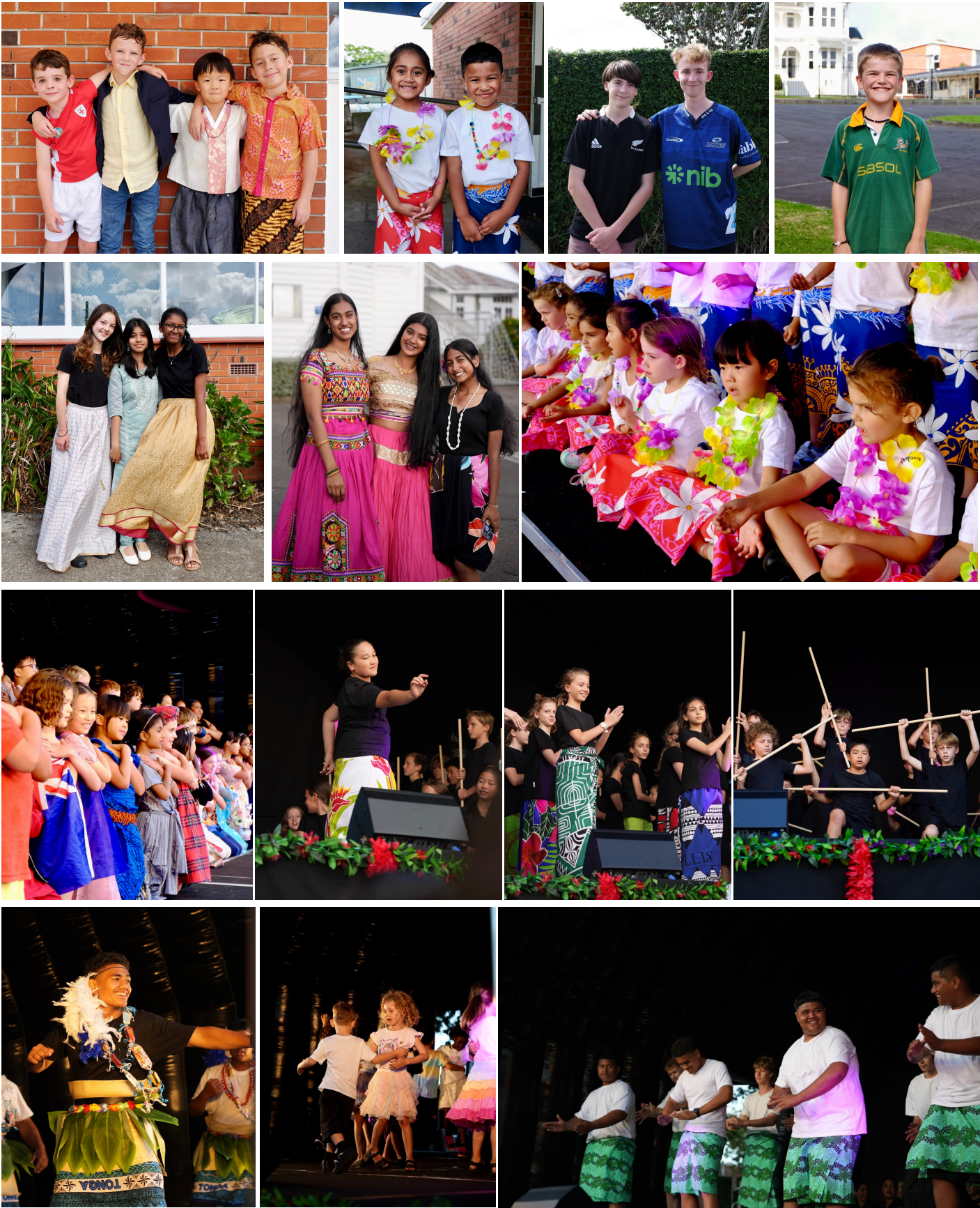
*You will find out the Cultural fiesta photos in the next newsletter.