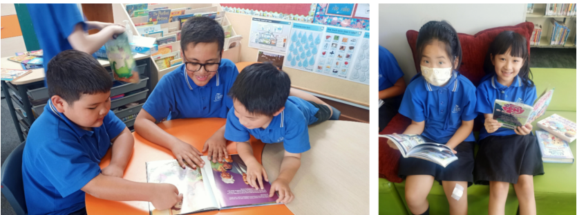
Reading highlights in Year 3: Buddy reading with Rm 6 and visiting the wharepukapuka.