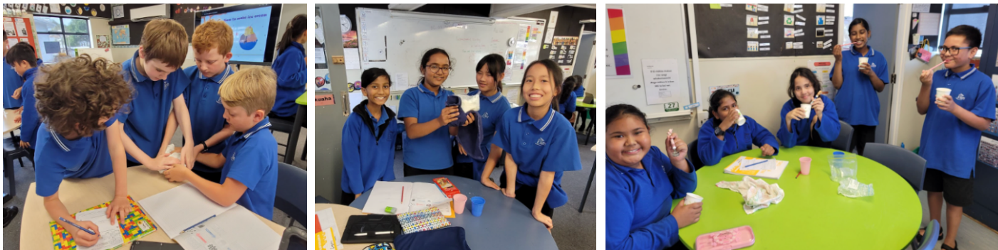
Year 6 students completing their 'ice cream in a bag' writing task.