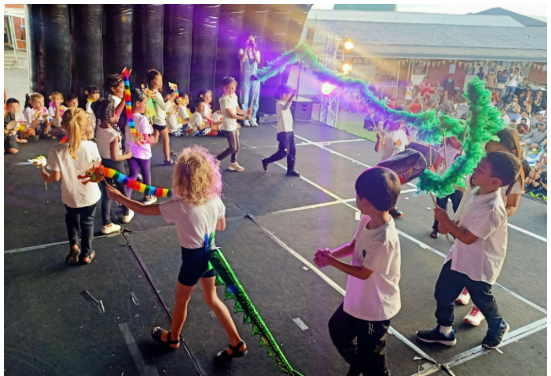
Room 3 learnt that with many dancing styles, you have to keep a count of 8. During their dragon dance, they kept count while moving their bodies, making shapes and keeping in time.